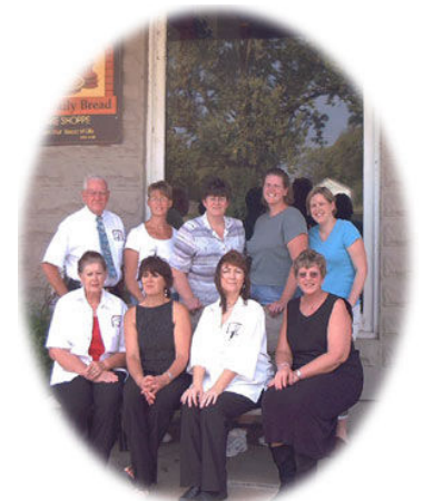
The Ladies of "Our Daily Bread" & Sweeney