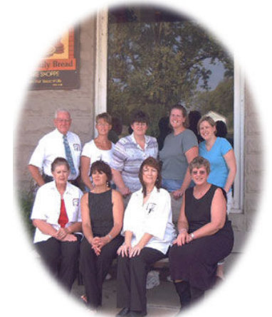
The Ladies of "Our Daily Bread" & Sweeney