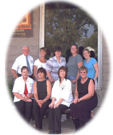
The Ladies of "Our Daily Bread" & Sweeney