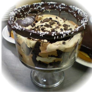
Mocha Latta Trifle