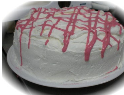
Raspberry Mousse Cake