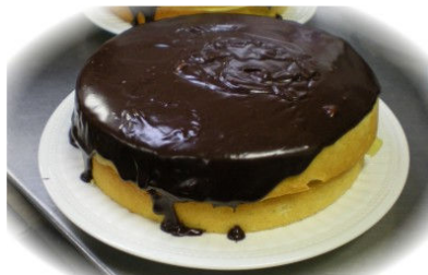
Boston Cream Pie

Enjoy Historic Barnes... Barnes has three antique shops that are open for your enjoyment. You can enjoy your meal, and enjoy browsing through the unique shops, around the park and fountain in our historic little town. While in Barnes enjoying staying at one of the several Bed & Breakfasts. You can visit Barnes on the web at www.barnesks.net . Or call 888-511-4569 for more info. There is also a DVD available called “Barnes, Kansas A historical Pictorial Story of a Small Town in Kansas.”