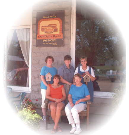
The Ladies of "Our Daily Bread"