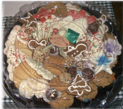
One of our famous cookie trays. We have gift baskets and trays available for your gift giving. Just call and give us your price range...We make it Beautiful!