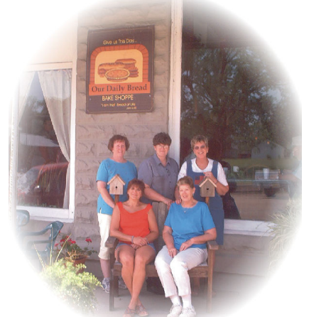
The Ladies of "Our Daily Bread"