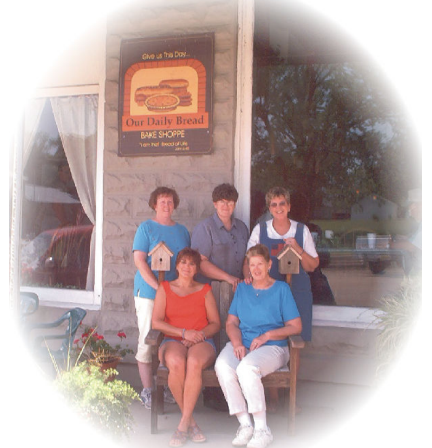
The Ladies of "Our Daily Bread"